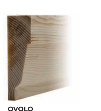
FINISHED NOMINAL 20.5mm x 57mm 25mm x 63mm 🕑 20.5mm x 69mm 25mm x 75mm 🕑

CHAMFERED & ROUNDED FINISHED NOMINAL 14.5mm x 44mm 19mm x 50mm (P) 14.5mm x 57mm 19mm x 63mm 🕶 14.5mm x 69mm 19mm x 75mm •